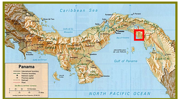
Map of Panama showing location of Wounaan communities of Rio Hondo and Platanares, mapped on previous page

est, well within the boundaries of the Wounaan lands. The colonos threatened the Wounaan, and challenged them to a physical confrontation to determine the matter. The Wounaan declined, preferring to work through more peaceful means. This map, and the information it contains, will be an invaluable part of that peaceful resolution. It will assist the Wounaan in their efforts to demonstrate to the Panamanian government the legitimacy of their claims, and the extent of the problem that they face. It will also be an important tool to help them monitor further colono expansion into their lands.